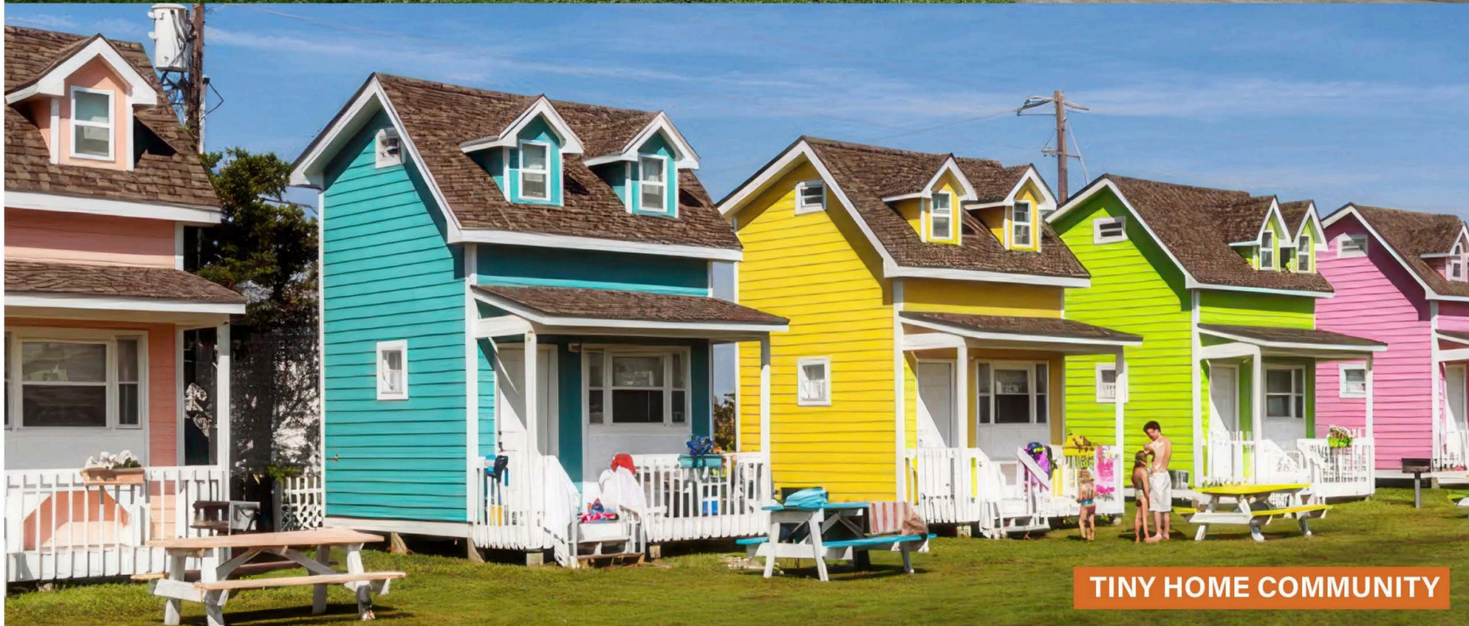
TINY HOME COMMUNITY