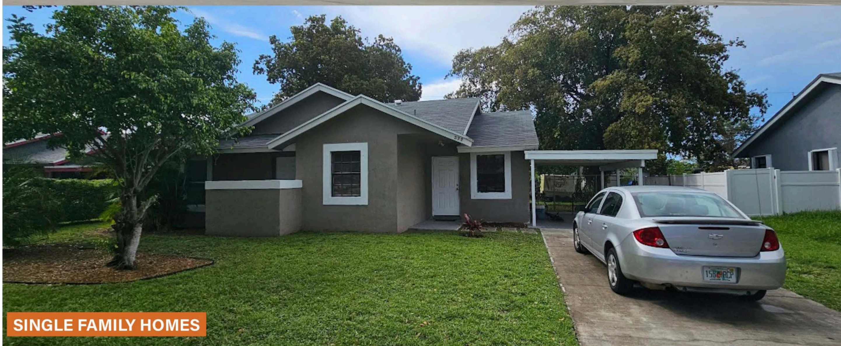
SINGLE FAMILY HOMES